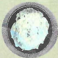
Executive Director of the Board