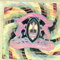
Chairman Uganda National Examinations Board